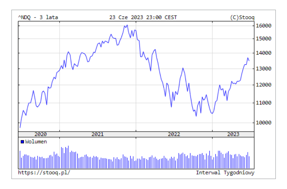
Chart 2. 3-year NASDAQ COMP index