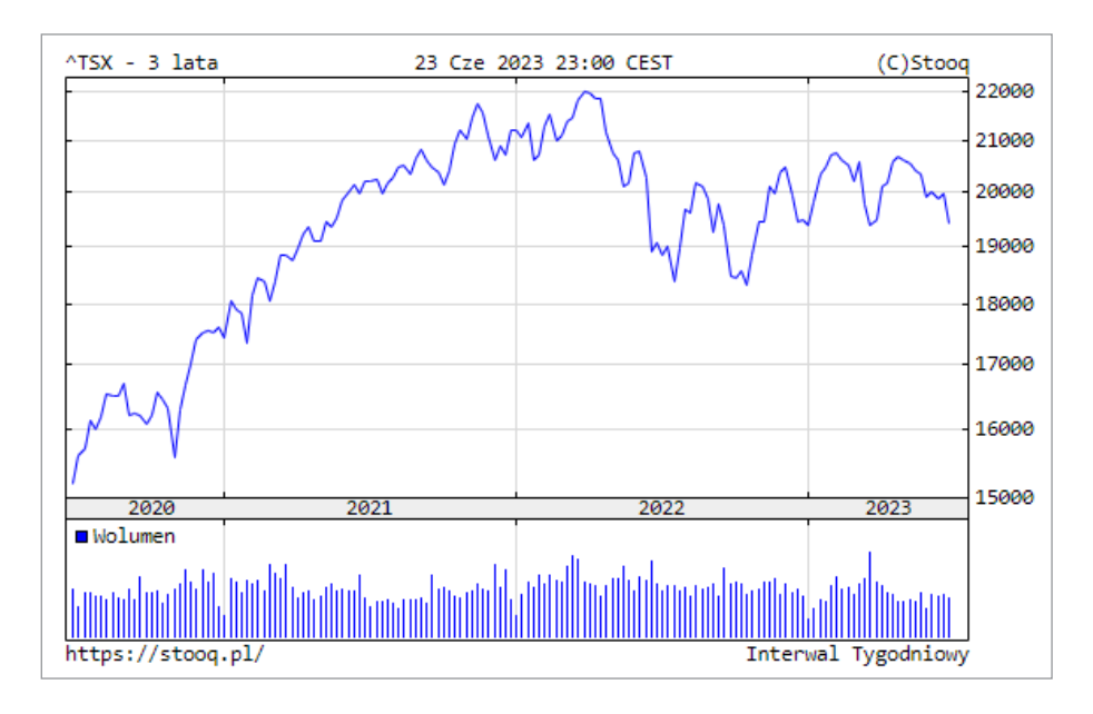
Chart 4. 3-year S&P/TSX COMP index