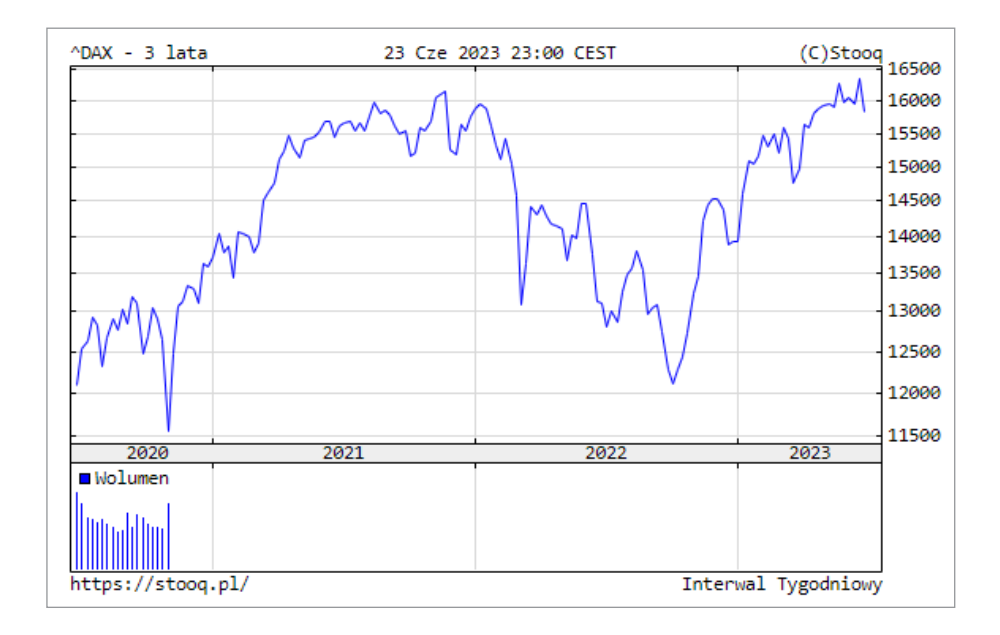
Chart 11. 3-year DAX index