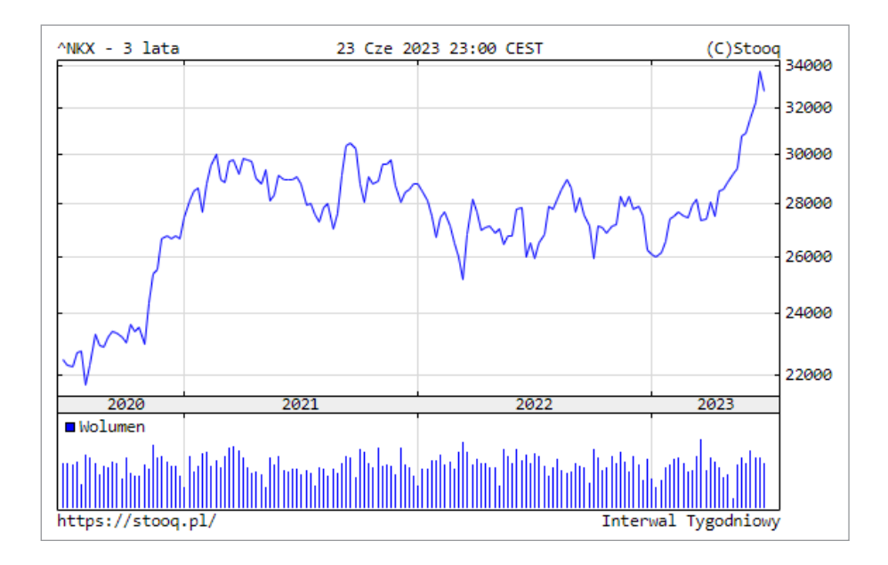
Chart 5. 3-year NIKKEI 225 index Source: stooq.pl, access: 6/24/2023.