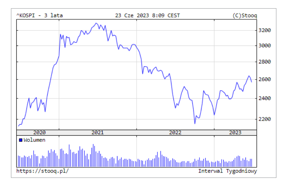
Chart 8. 3-year KOSPI index