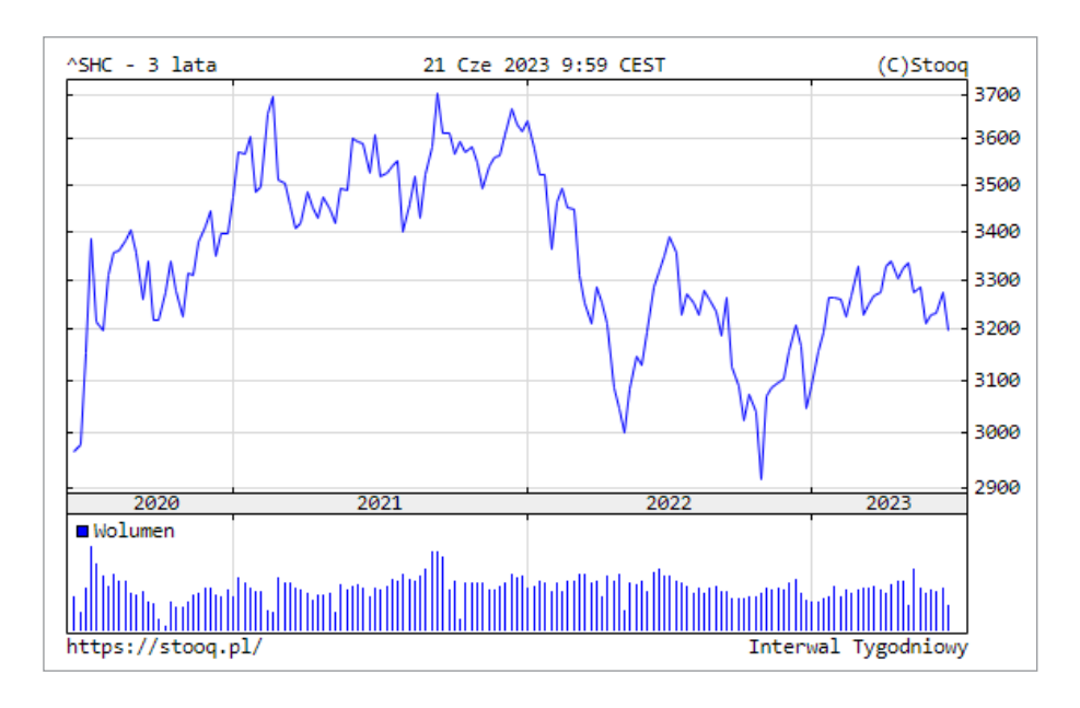
Chart 6. 3-year SSE COMP index