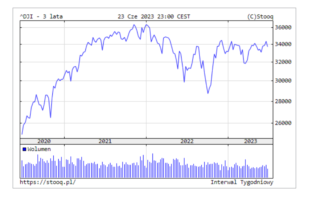
Chart 1. 3-year DJI index

It is obvious that the picture resulting from the data contained in the above tables is simplified, to some extent dependent on the adopted quite rigid starting and ending dates of the analyzed periods. A more detailed picture can be found in the charts below, which show the rates of the analyzed indices over the last 3 years (weekly interval). They clearly show the end of the bull market at the end of 2021 and the beginning of 2022. In my opinion, this is partly the result of symptoms announcing a Russian invasion of Ukraine, which were taken seriously by global markets. There was a temporary deepening of the declines in the stock markets on the day of the invasion, but then we were dealing with increases. However, the lowest levels were reached by most of the analyzed indices at the beginning of the fourth quarter of 2022, but it is difficult to associate this directly with the war in Ukraine.