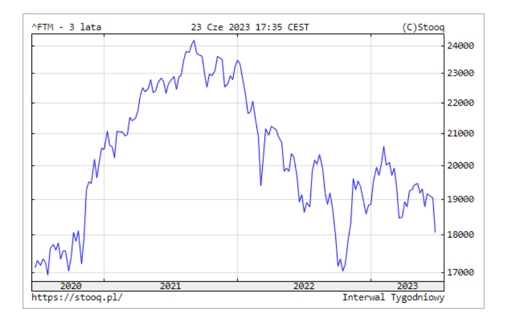
Chart 9. 3-year FTSE 250 index