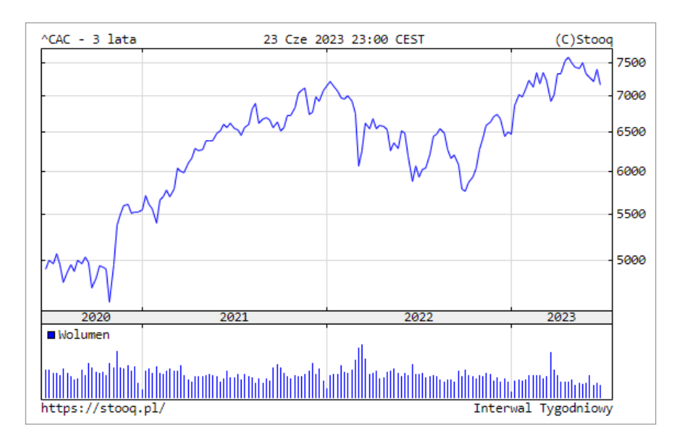
Chart 10. 3-year CAC 40 index