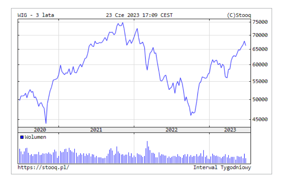
Chart 12. 3-year WIG index